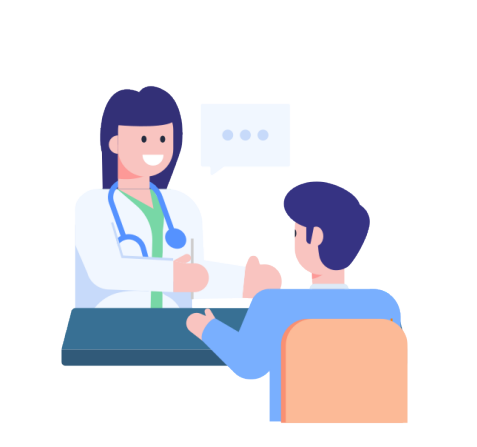
Increased successful appointment rates